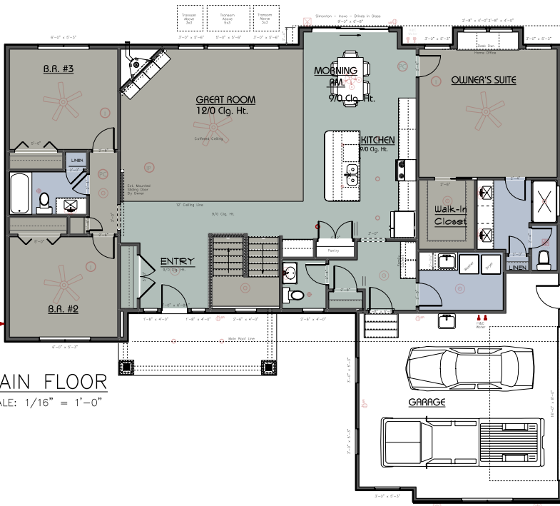
MAIN FLOOR SCALE: 1/16" = 1'-0"